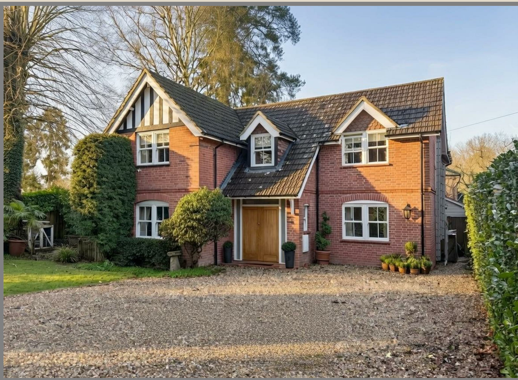
Oak Tree House - Andover Road, Newbury, RG14 6NB